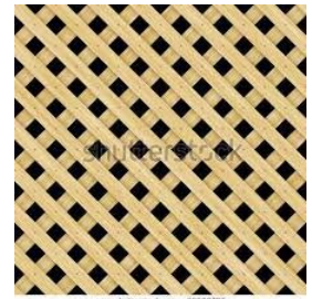
c) Lattice Panel

Minimum openness for screens of single-plane construction shall be 15%. Minimum openness of one side for screens of double-plane construction shall be 40%; for example, a 3½" board space Alternate Board screen is 46% open, and a 3 board/3 space Basketweave screen is 50% open.