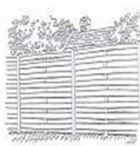
b) Basket Weave